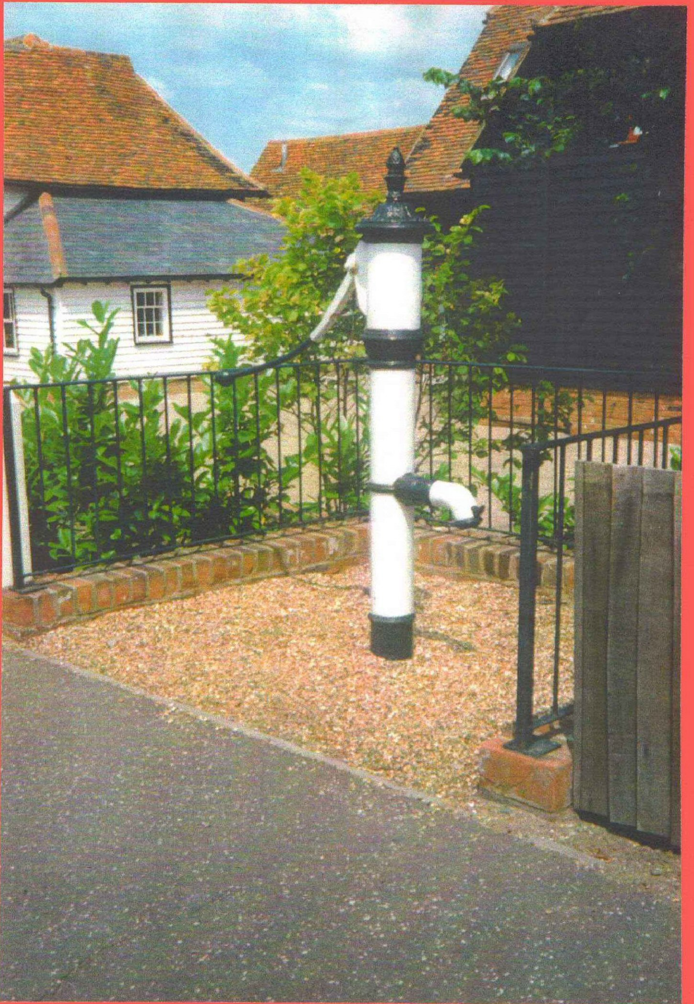
Brewer's End Takeley Pump