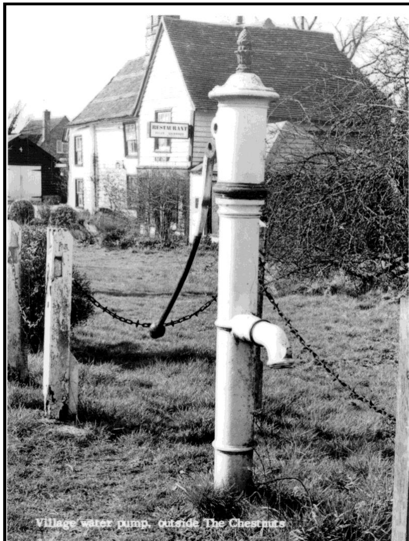
Postcard of the pump

The pump would have been a very important feature in Brewers End as the sole water supply for many families. It even featured on a village postcard. It can still be seen beside the road through Brewers End outside Chestnuts, where one of the shareholders, Mr Lambert, had a post office, grocery shop and general store. Across the road at Guyvers George Piper ran a carpenters/undertakers business although that does not do justice to the wide range of items and services that were for sale.